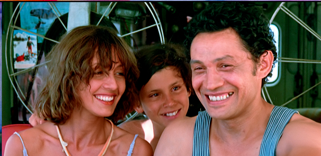
El Cine Soy Yo / The Moving Picture Man 19:15 - 21:30